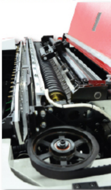
Seal Head / Cutting Belt