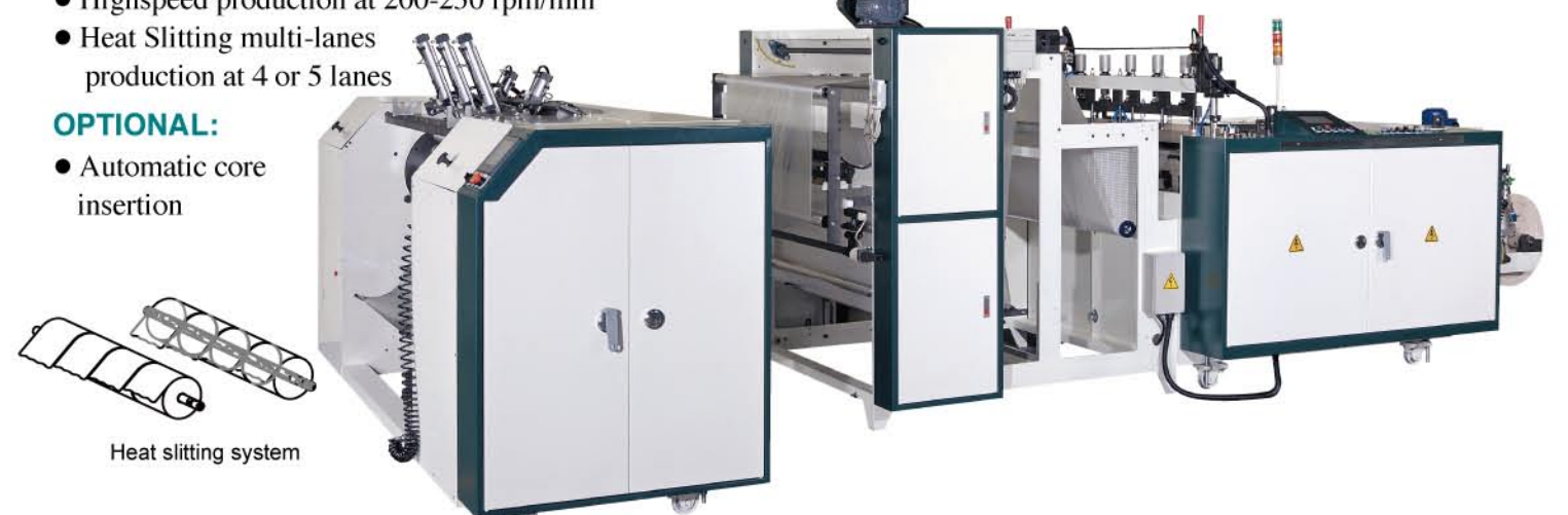
Heat slitting system